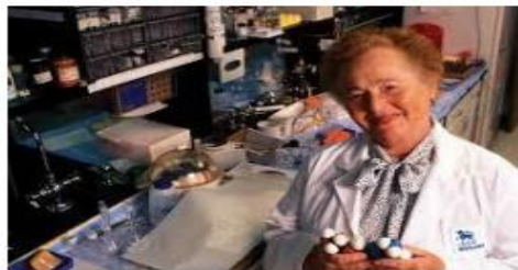
Gertrude B Elion.