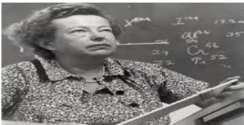
Maria Mayer Goeppert.

5. Observe the following images of successful women scientists. You should investigate their biography and write two ideas about what they did in science (in English).